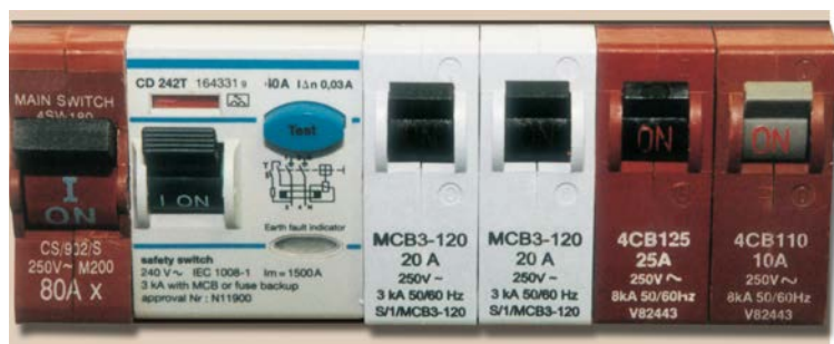
Figure 1 Typical switchboard with the main switch, safety switch with test button, and four circuit breakers.

If you think the work completed by an electrical contractor or electrician has not been completed correctly, please contact the Electrical Safety Office.